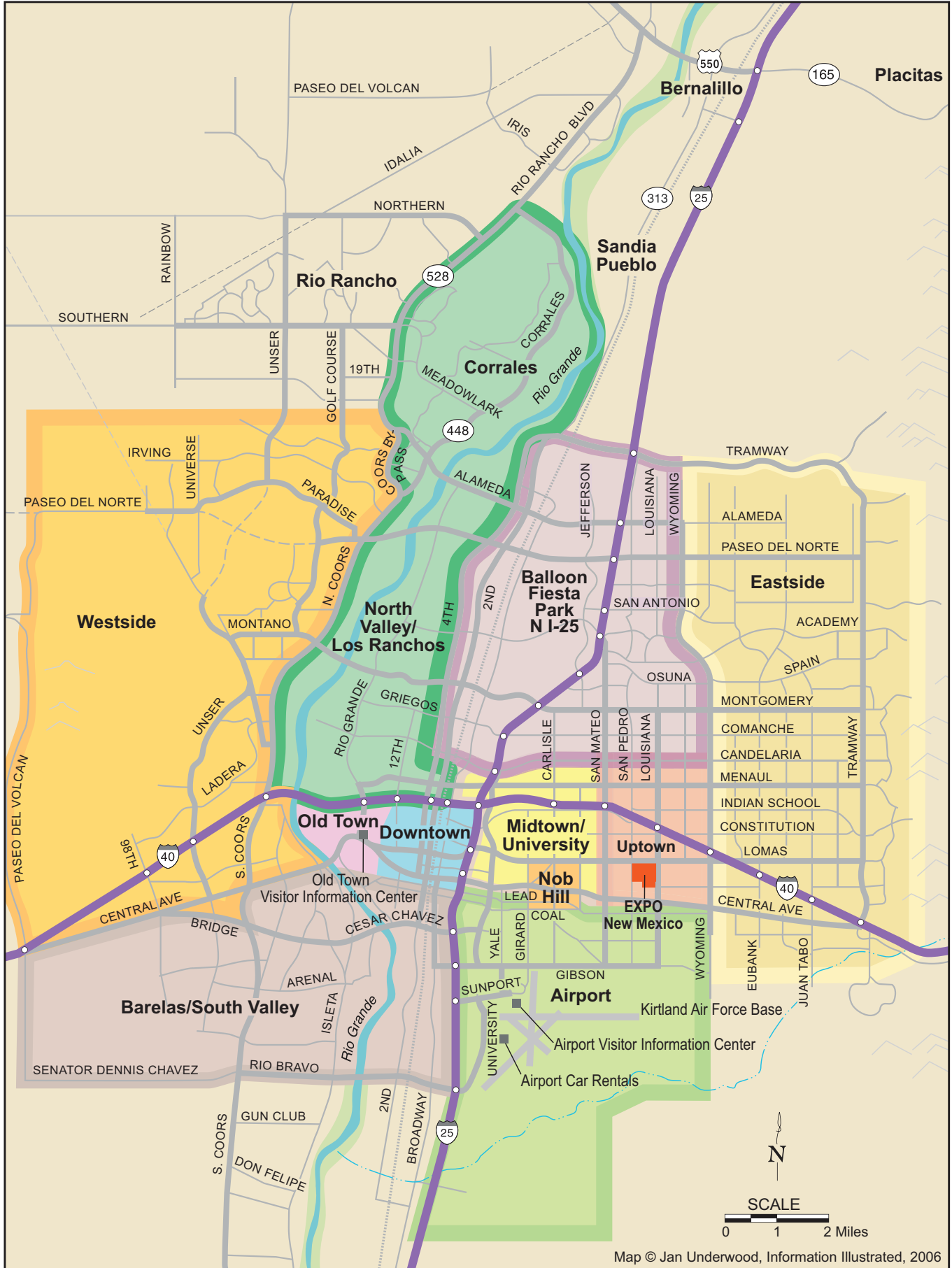
Map © Jan Underwood, Information Illustrated, 2006